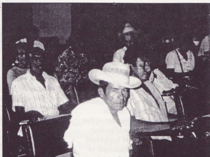
Apartadó Community representatives meet with Dane County Delegation

This represents a setup orchestrated by the political enemies of the detained leaders and with the complicit participation of government agents, for whom the presence of alternative political movements and the high degree of organization of the popular sectors in the region is apparently inconvenient. They wish to discredit these people and prevent