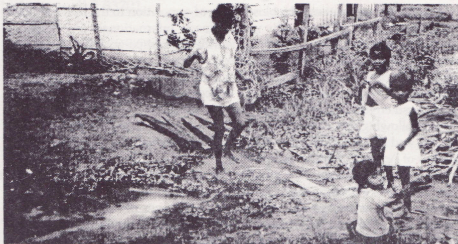
The arrest of Apartadó's leaders will delay the installation of public works to replace the open sewers like this in La Chinita Barrio.