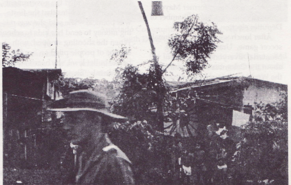
Children in La Chinita watch with concern as the Military Police arrive to "protect" the Dane County delegation.